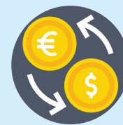
General Trading and Retail