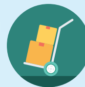
Manufacturing and Production