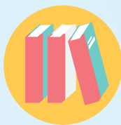
School, College and Nurseries